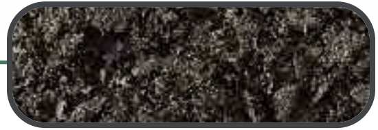
Composted pine bark