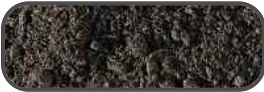
Plaisted's organic compost

Plaisted's Premium Garden Mix is comprised of Plaisted's Organic Compost , Peat, Inc. Coarse Fibrous Peat , Plaisted's Coarse Sand and Plaisted's Screened Soil . We blend this product by using Plaisted's computerized Accublender™ to assure a consistent product... load after load.