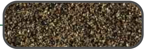
Plaisted's coarse sand