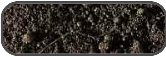
Plaisted's screened soil

Plaisted's Amendment for Sandy Soil is comprised of Plaisted's Screened Soil , Plaisted's Composted Pine Bark , Plaisted's Organic Compost , and Peat, Inc. Fibrous Coarse Peat . We blend this product by using Plaisted's computerized Accublender™ to assure a consistent product... load after load.