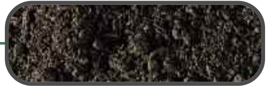
Plaisted's organic compost