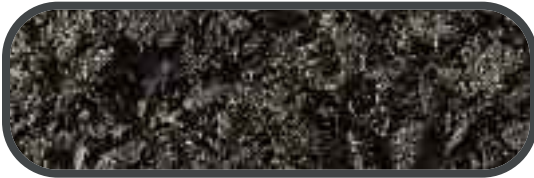
Composted pine bark

Plaisted's Amendment for Clay Soil is comprised of Plaisted's Composted Pine Bark , Plaisted's Organic Compost , Peat, Inc. Fibrous Coarse Peat and Plaisted's Coarse Sand . This Amendment is blended using Plaisted's computerized Accublender™ to assure a consistent product...load after load.