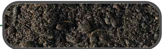
Plaisted's organic compost