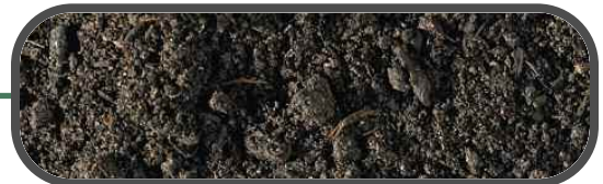
Plaisted's organic compost