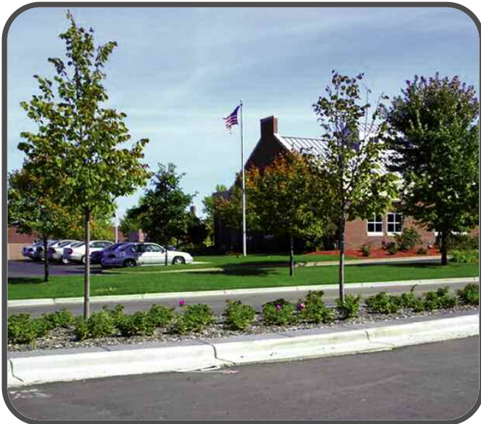
Plaisted's Certified MN DOT soil mix is used for these decorative plantings